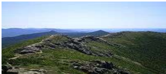
The Easy Part