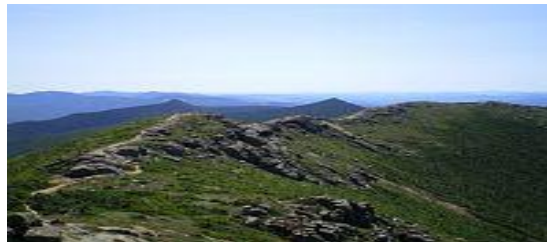
This is the easy part